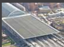
St Pancras, London