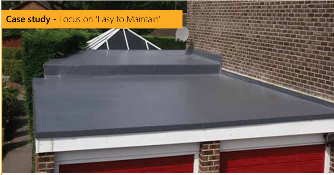
Case study - Focus on 'Easy to Maintain'.

“Sarnafil offered a system that would take very little upkeep through the duration of its life...”