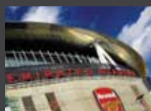
Emirates Stadium, London