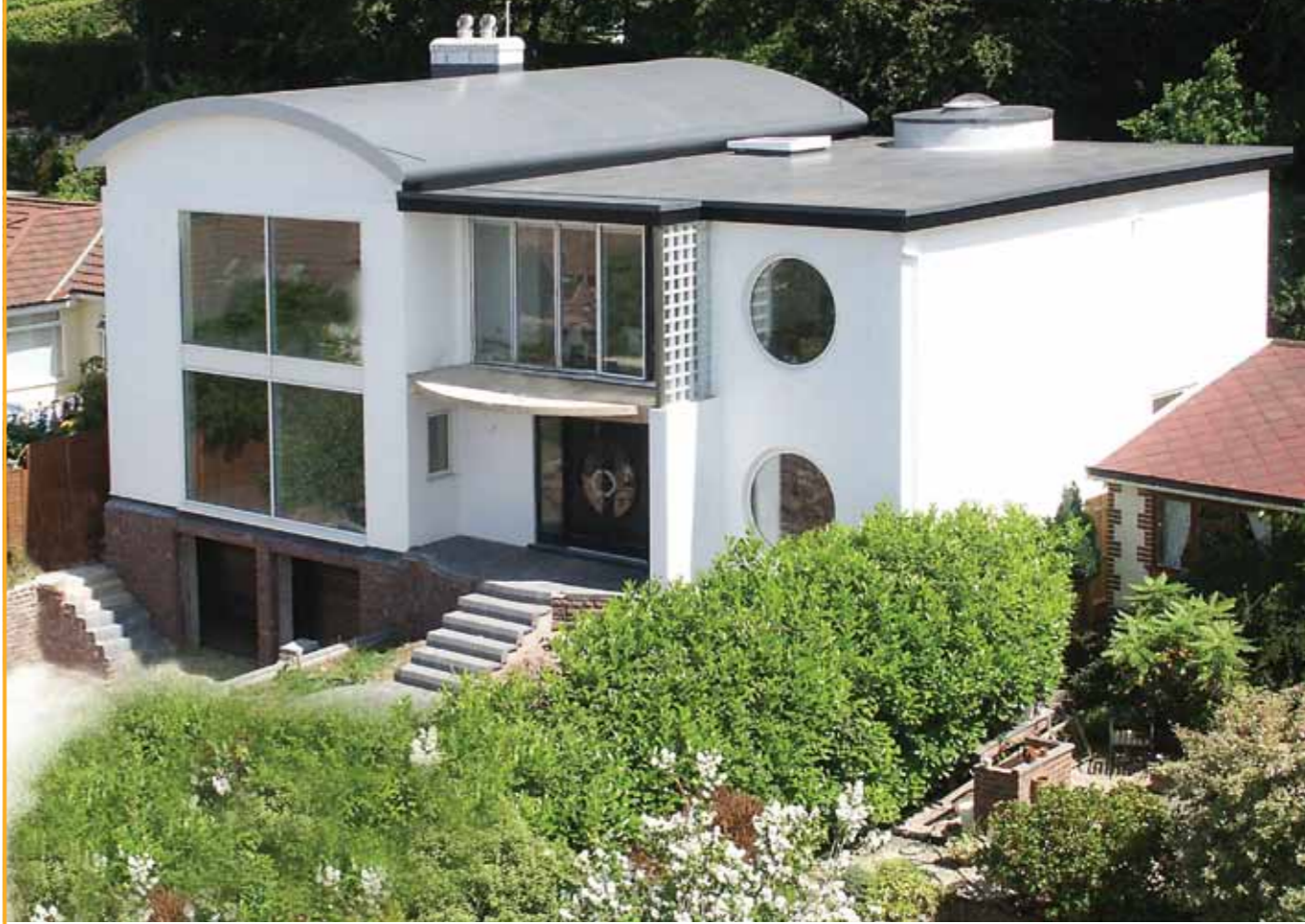
Case study - Focus on 'Aesthetics'

This Grade II listed building is located in a West Sussex conservation area. The homeowner was very aware of the potential theft risk to the new roof that installing traditional lead would create. Through discussion with the planning and conservation agencies, approval was granted for a Sarnafil roof in lead grey with matching batten roll profiles to be installed to ensure the traditional features of the property were maintained. Additionally, the extravagant costs associated with lead materials, and the difficulty to find trained and qualified installers made the choice simple. Roof Assured by Sarnafil fulfilled the criteria, giving the homeowner a substitute which offers greater value for money, that met Planning Authority consent for this project, and most importantly was supplied and installed by approved, trained and qualified, Registered Installers.