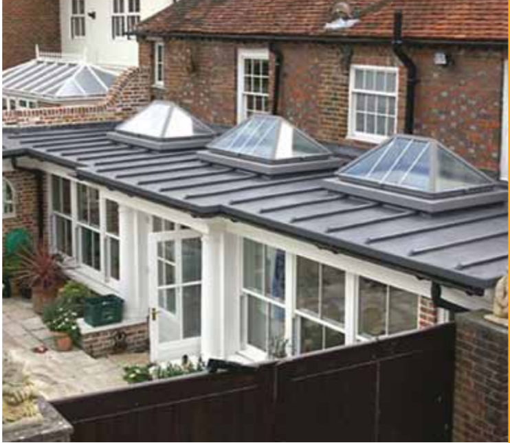
Case study - Focus on 'Trusted Installers'

Being situated in close proximity to the seaside, it was essential that this homeowner secured a lengthy guarantee on their roofing system. Sarnafil was the perfect choice. A “unique to that property” specification was prepared including wind uplift calculations. This provided confidence for the client that a Sarnafil product has the durability and flexibility to contend with the strong winds and fluctuating temperatures of the Bournemouth coast, along with a 15 year product guarantee and the peace of mind that Sarnafil has a life expectancy exceeding 40 years*.