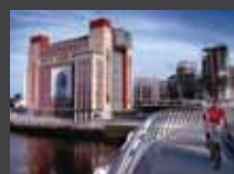
Baltic Centre, Gateshead