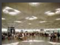
Passenger Terminal, Stansted Airport