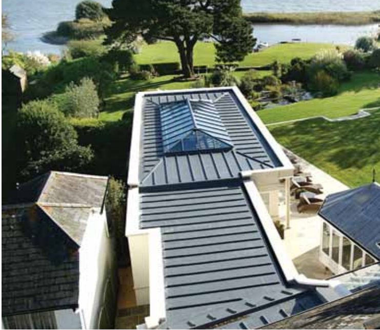
Case study - Focus on 'Guarantees'

“We understand that a roof can define the look of your home...”