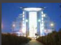
St David's Hotel, Cardiff Bay